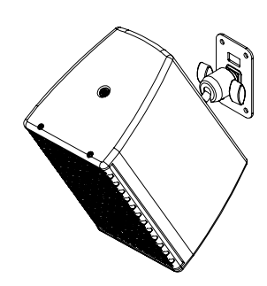
WP-41 & BM-41